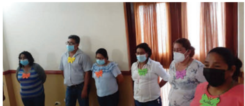
Members of our Community Partners, hotel in Managua

The workshops are dynamic events that provide a wonderful opportunity to facilitate sharing among the partners and also strengthen Casa – Pueblito. Following the workshops, some partners have established bilateral exchanges.